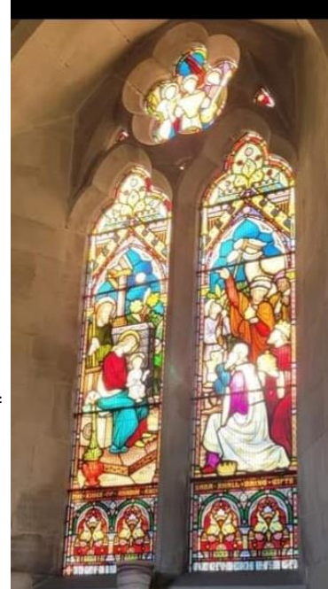
St Botolph Church, Bradenham

We now say goodbye to the Magi as we prepare for Lent beginning on Ash Wednesday